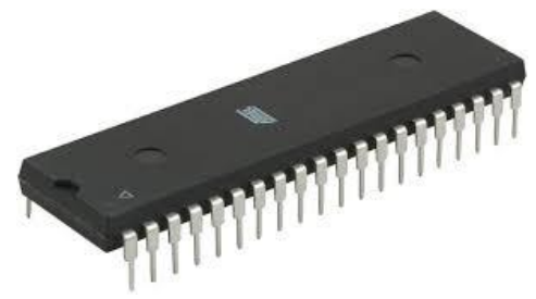
Fig 1: Microcontroller Chip

There are two ways to control an electronic circuit either using: Microprocessor or MCU. The Microprocessors are usually referred to as general purpose microprocessors because they do not contain RAM, ROM and I/O ports. So, system designers have to add an external RAM, ROM and I/O ports to make a system functional. Addition of these components will make the system bulkier and much more expensive. The advantage of using microprocessor is that the designer can decide the amount of RAM, ROM and I/O ports needed to accomplish a task.