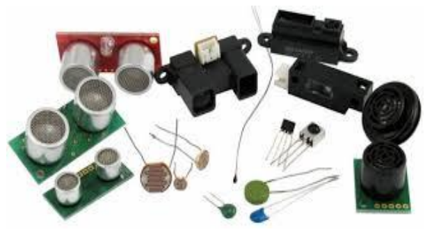
Fig 4: Different types of sensors

Different types of sensors can be employed to detect the unauthorized presence. It could be an infrared sensor, vibration sensor etc.