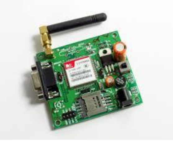
Fig 2: GSM module

A GSM module is a second generation digital mobile cellular technology, which covers a fairly broad geographical area. This offers customized travel, financial, reference and commercial information to the users [30]. It can operate in 400MHz, 900MHz and 1800MHz frequency bands. The GSM modem can accept a SIM card just like a mobile phone and operate on a subscription to a network of mobile data transfer. The GSM Modem supports three types of services namely bearer or data services, supplementary services, and telecommunication services. A typical GSM picture is given below: